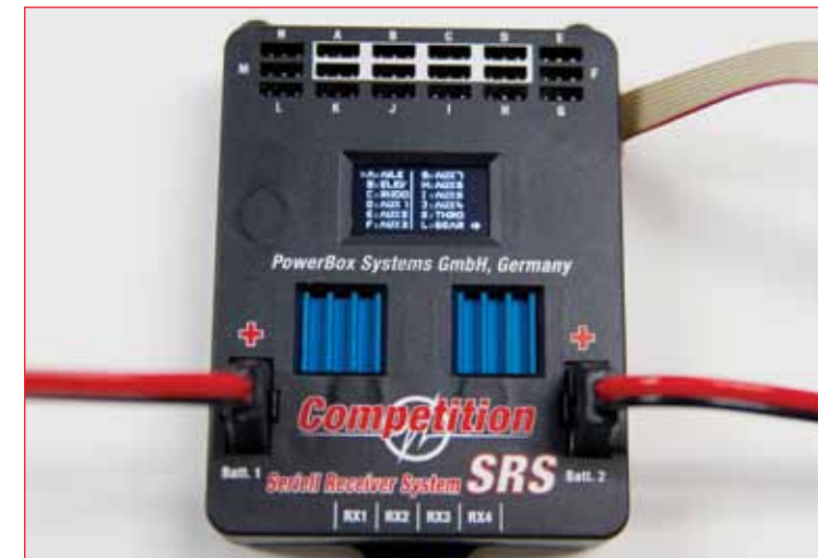
You can do output mapping to determine what port controls what function. You can also adjust servo travels, end points, travel volumes and centering.

servos do their work at different rates of current consumption. As the servo does its work, the bus' voltage is applied across the load (the servos' motors). Therefore, if some servos consume more current than others, more voltage is dropped across their loads. This is the same as saying that some servos will pull the bus' voltage low for the others on the bus. That then means that all the servos' performances are eroded by their lack of voltage because of the current consumed by the few. It kind of reminds you of communism, doesn't it!