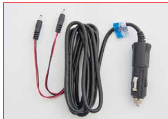
This 12-volt car charger is designed to charge both battery packs at the same time. You just plug it straight into the packs. It includes a nice, long extension cable.