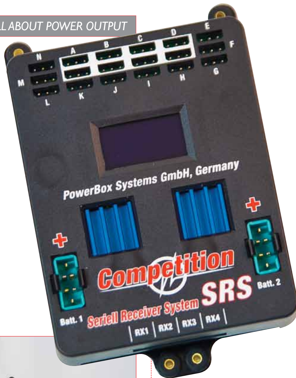
The new PowerBox Competition SRS includes inputs for two battery packs, heat sinks, four ports for remote receivers and a 128 x 64 OLED display.

It is! It's all about the power output for the PowerBox system. It is about maintaining the output voltage and current for the control systems that today's generation of large-scale airplanes, sailplanes, jets and scale helicopters use. The PowerBox system is about getting the most performance out of your aircraft by guaranteeing that all servos, receivers and telemetry get clean, steady and reliable power. It is why so many championship RC pilots are now fitting their models with PowerBox power supply systems. I first started using a PowerBox Royal power supply in my models about five years ago. It was after reading a report about what the PowerBox system does for supplying voltage and current to the servo systems. It was also after witnessing a couple of very scary crashes where the new generation of high-powered servos had consumed the aircraft's battery capacity in a short period of time, which resulted in the airplane losing control.