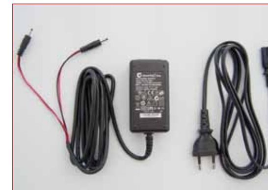
The 120/240 VAC wall charger is also designed to charge both PowerBox LiPo packs at the same time. Mine came with the plug used in Germany, which I changed out for a U.S. type.