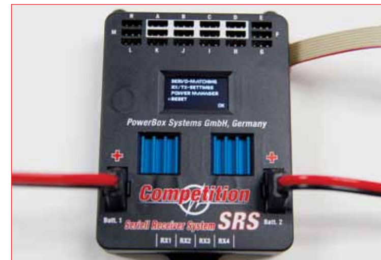
If you need to use your PowerBox Competition SRS in another model, you can reset all the program functions and parameters you've saved at this screen. Then you'll have it ready for reuse.