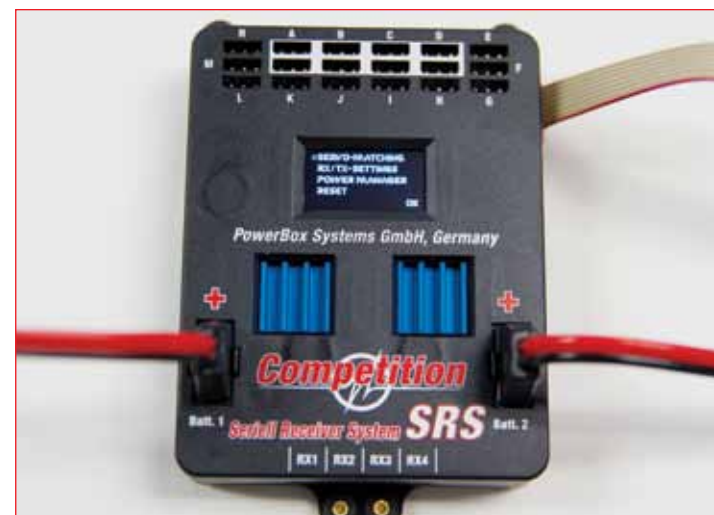
You can use the Servo-Matching program function to match the servos to each other. Again, you enter the programming function and just step through the menu.