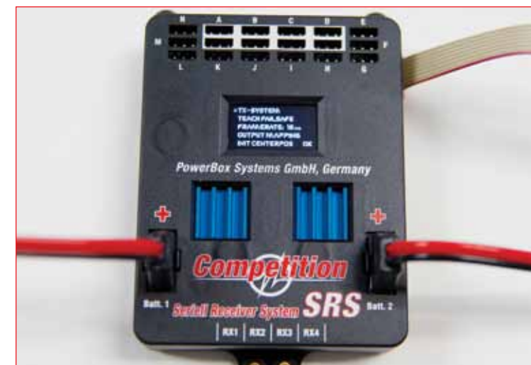
This is the screen you'll use to select the transmitter system that you'll be controlling your airplane with. In this function you can also bind the radio to the receivers.