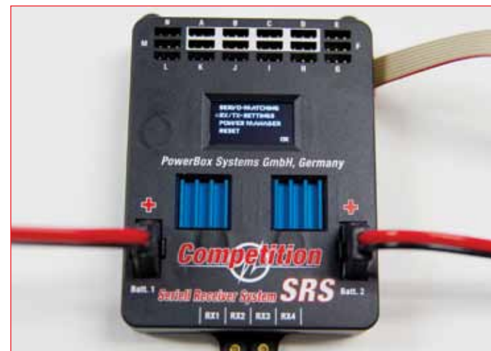
Entering this function will let you adjust the settings for both Rx and Tx. This is an intuitive process; however, PowerBox's instruction manual is one of the best I've ever used.

The PowerBox system uses very advanced technology to ensure that our airplanes' control systems get the power and signal they need. Considering this, it is no wonder that so many championship pilots are installing PowerBox systems in their competition models. It is also the reason that pilots who want the most from their models in terms of security and performance are using PowerBox hardware.