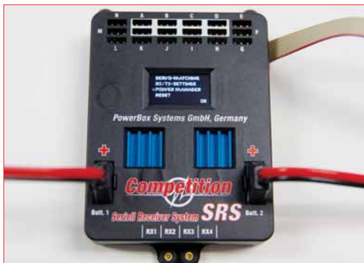
You can program the Servo-Matching, Rx/Tx settings (frame rate) and Power Manager, and reset the unit. You simply enter the programming mode by holding down the Set button.