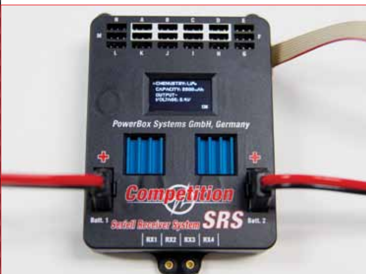
Once you have entered the programming mode, you can toggle through the functions by pressing buttons I or II on the switch. The SET button is used to confirm a selection.