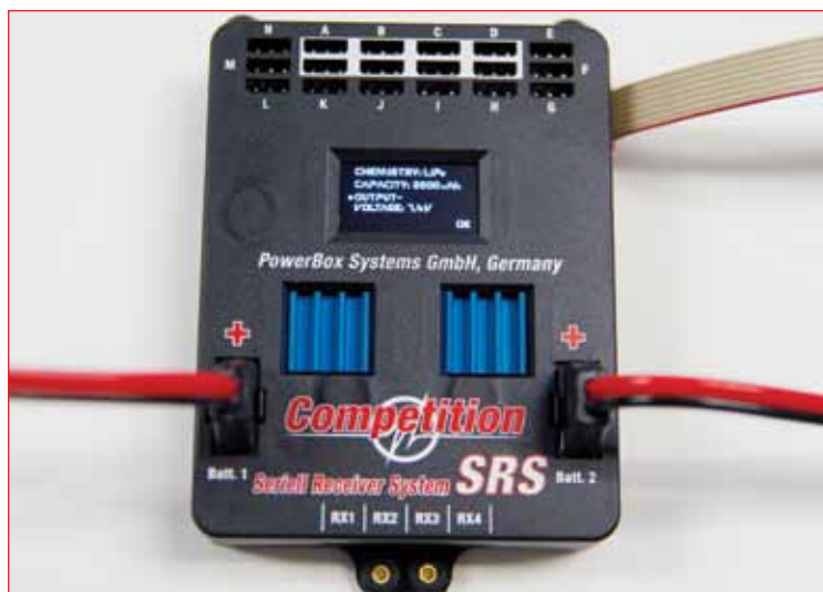
At this screen you can choose the output voltage you want to use. In my case I've picked the 7.4-volt output that will drive my Hitec RCD high-voltage HS-7950TH servos.