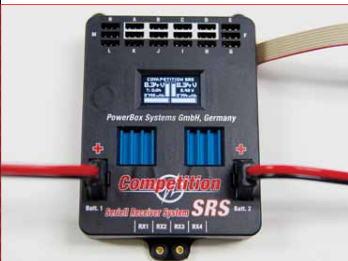
The new PowerBox Competition SRS power supply is super easy to program. And you can now program it with the on/off switch that comes with the unit. Here it is showing the bootup screen.