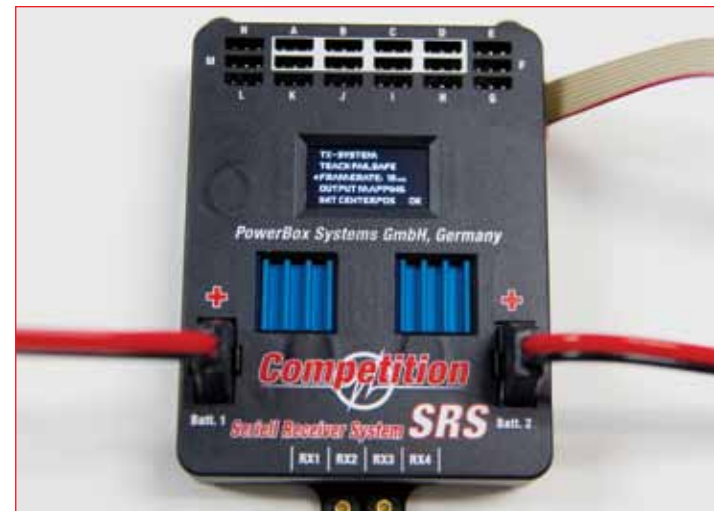
Here I've set the frame rate to 18 ms. From this screen you can also pick the type of transmitter you'll be using, such as Spektrum/JR, Multiplex, Futaba or Jeti.