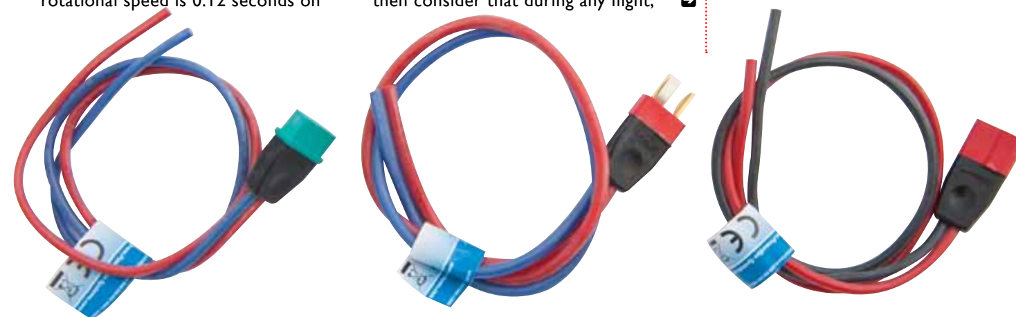
PowerBox provides you with lots of input leads for using battery packs to power their power supply, so you can use NiCd/ NiMH, LiFe or Li-Ion packs.